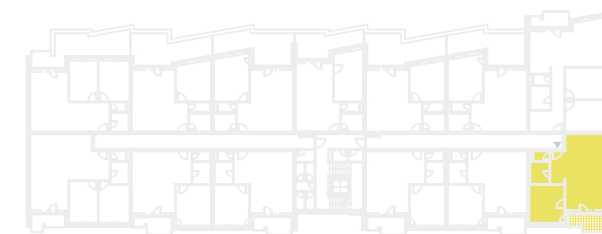
s c h é m a p ô d o r y s u 3 . N P / s c h e m e o f t h e t h i r d f l o o r